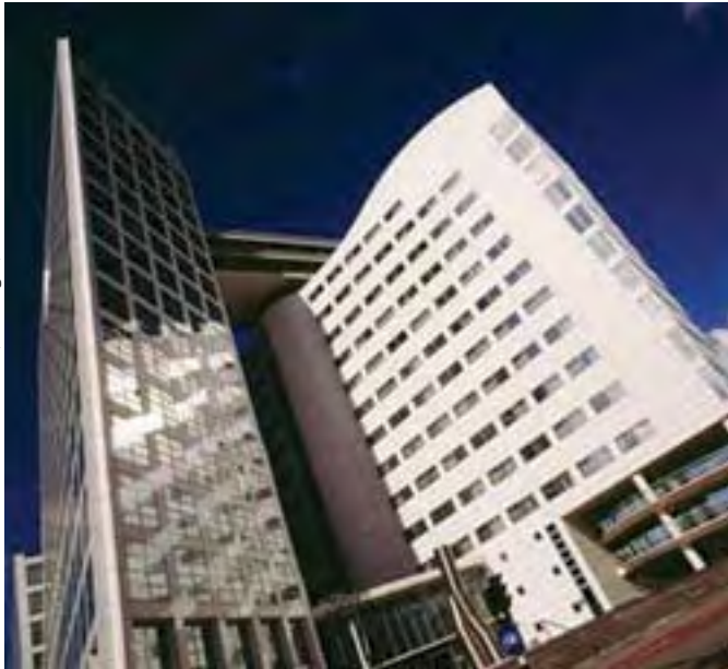
Exterior view of International Criminal Court, The Hague, Netherlands

“By 1998, the internationalists decided the world was ready to accept an international court to adjudicate the vast body of international law.”