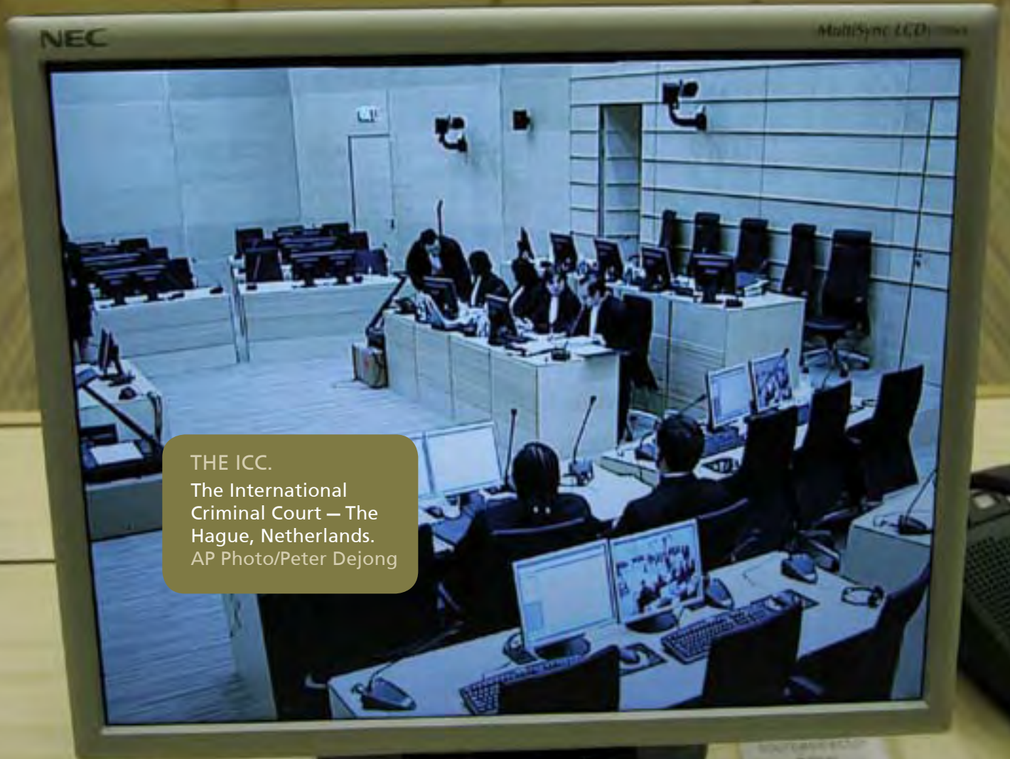
THE ICC. The International Criminal Court – The Hague, Netherlands.