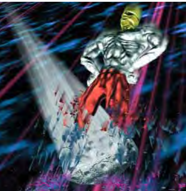
During the days of this last world empire, the God of heaven will destroy human government and establish His kingdom which shall reign forever. The stone that smites the image on the feet represents God; the feet symbolize the endtime world government—a union of politics and religion led by the Antichrist and False Prophet. (Endtime image)

Often the pope was so powerful that he appointed the rulers of Europe. Upon